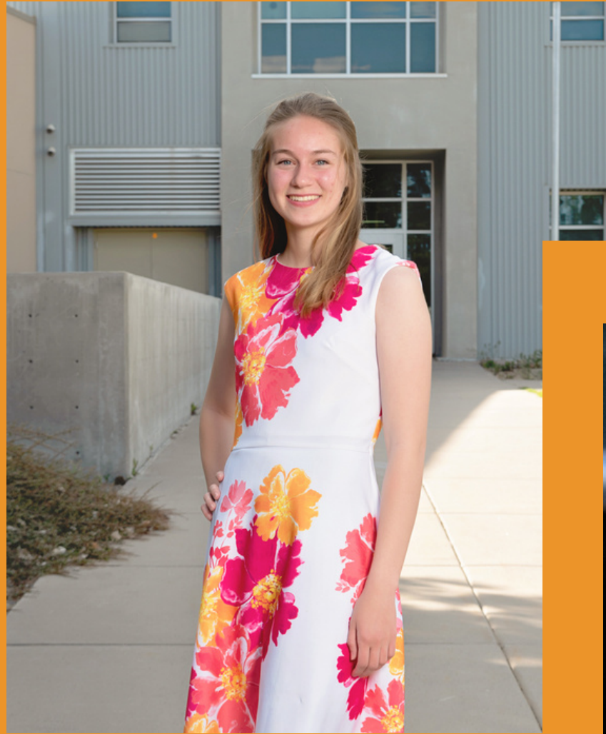
College: New Mexico Tech Major: Chemical Engineering