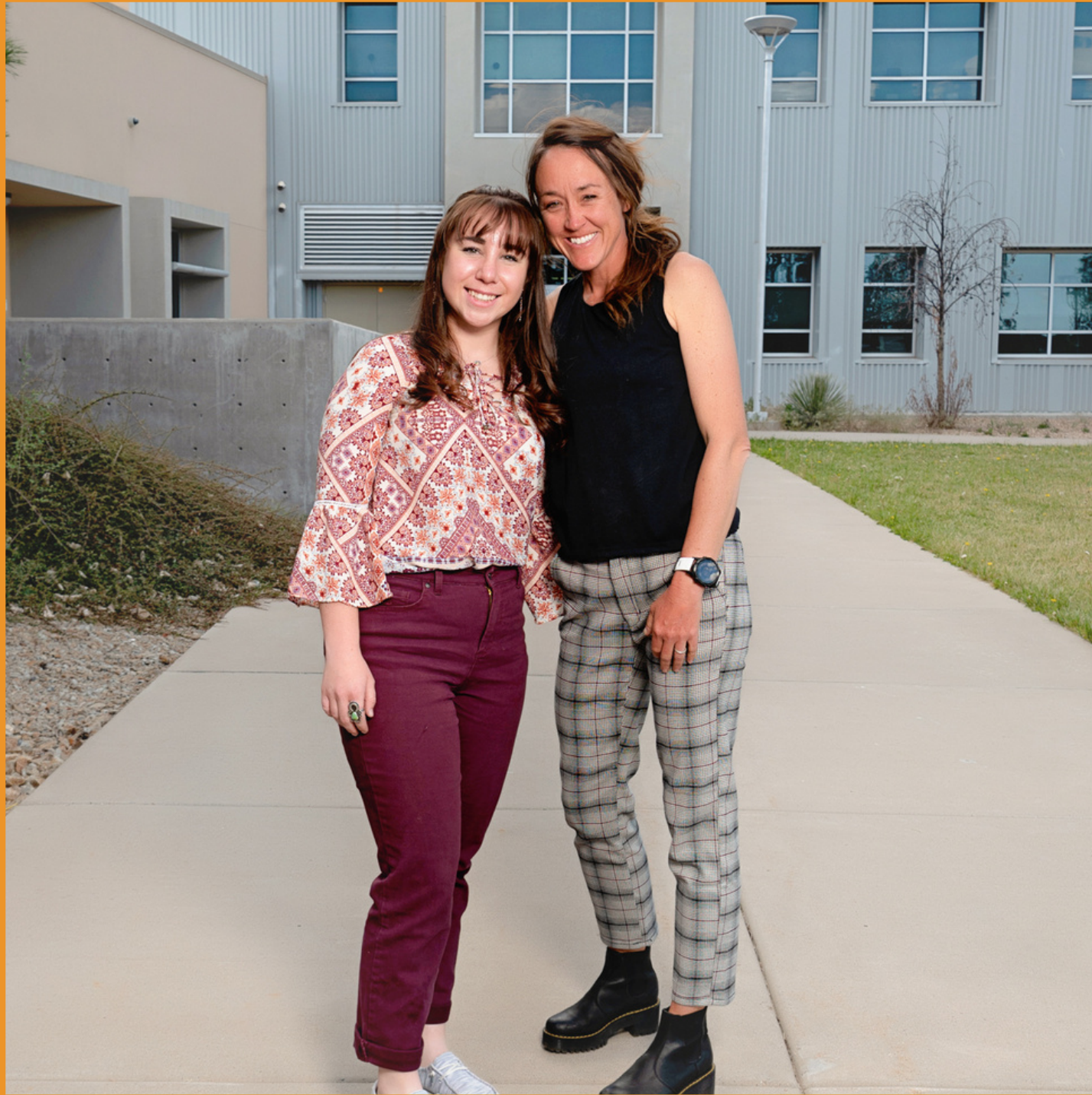
College: New Mexico State University Major: Agriculture Communications