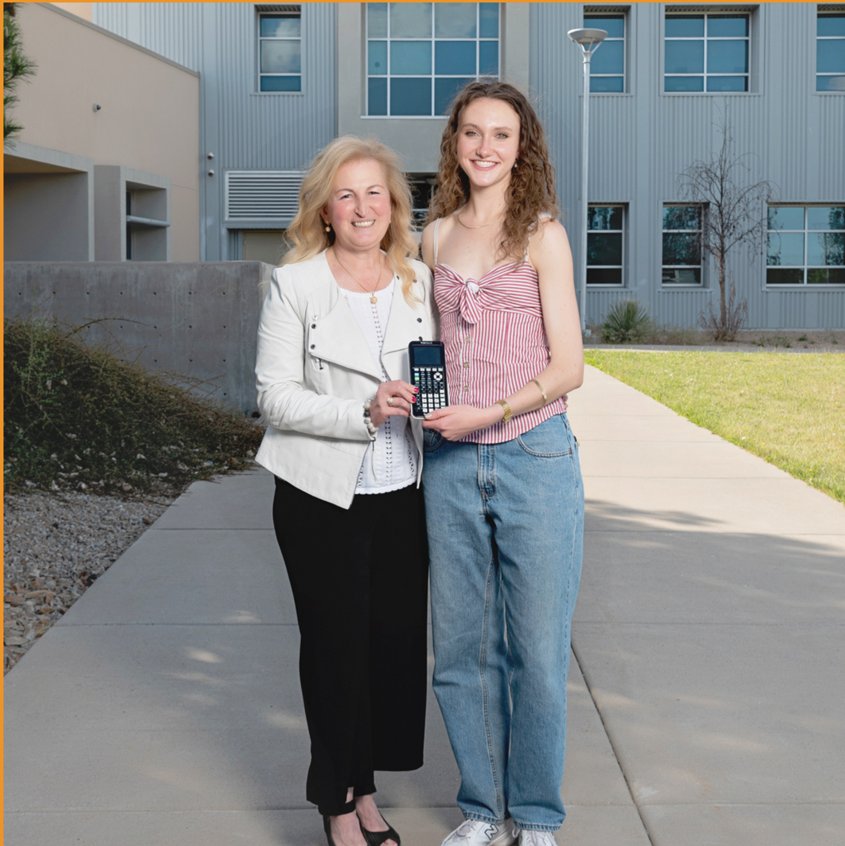
College: Claremont McKenna College Majors: Economics and Political Science